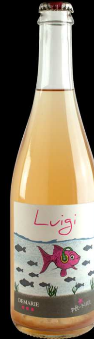
“LUIGI” Rosato Pét-Nat style wine made with Arneis & Nebbiolo grapes

... all you need is LOVE, but wines can help!