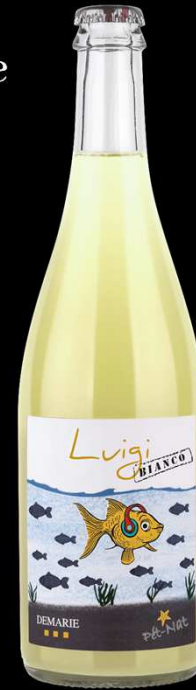
“LUIGI” Bianco Pét-Nat style wine made with 100% Arneis grape