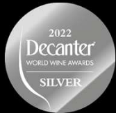
BAROLO DOCG Riserva