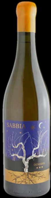
“SABBIA” An Orange wine made with 100% Arneis grape