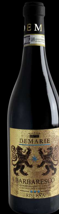
BARBARESCO DOCG Riserva